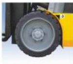
Large front tyres for enhanced road grip and stability