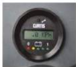
Elegant Instrument Panel with on board diagnostics