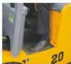
Wider Operator foot rest for safer entry and exit