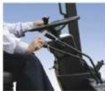
Ergonomically located levers for ease in operation