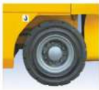
Minimum rear overhang for less turning radius