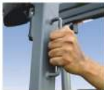
Large operator hand assisted access grip