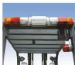
High Mounted Rear Combination and Beacon Lights