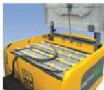
48V battery & AC traction for longer hours of operation