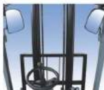
Wide view mast for clear front operator visibility