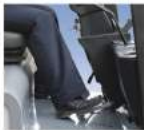
Ample leg room for operator comfort