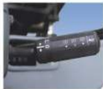
Easy access combination switch